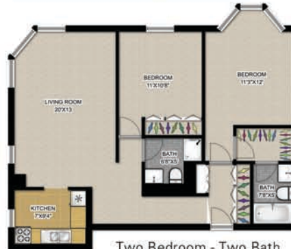
Two Bedroom - Two Bath